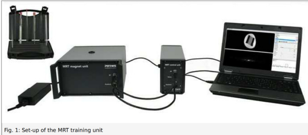
Fig. 1: Set-up of the MRT training unit