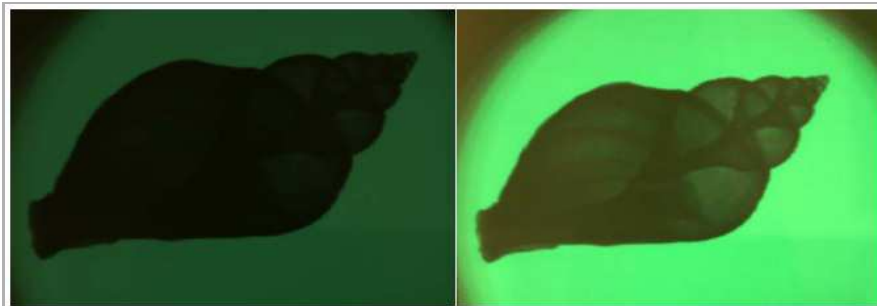
Fig 4: The shell of a common whelk with different anode voltages

When the anode current is reduced, the image gets darker. The same happens when the anode voltage is reduced (Fig. 4).