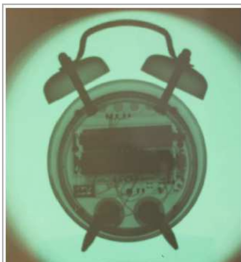
Fig. 2: Radiography of a digital alarm clock.

Note: If you would like to take a picture of an object that “floats in space”: Place it on a kitchen sponge. The sponge transmits nearly the entire X-radiation.