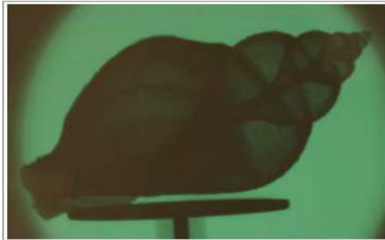
Fig. 3: Radiography of the shell of a common whelk

Figure 2 shows that the transmission depends on the thickness of the absorber. The snail shell consists completely of the same material, but in the area of the spindle there is more "mass" between the X-ray source and the screen. This is why this area is more clearly visible due to its higher absorption level.