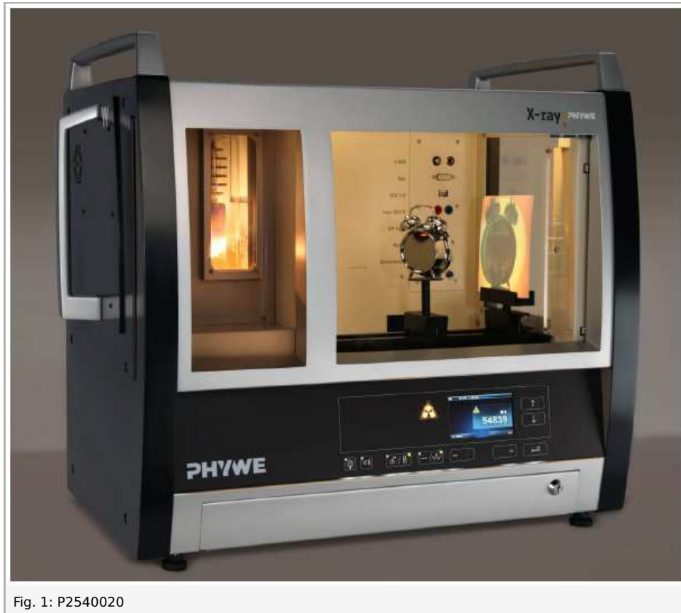
Fig. 1: P2540020