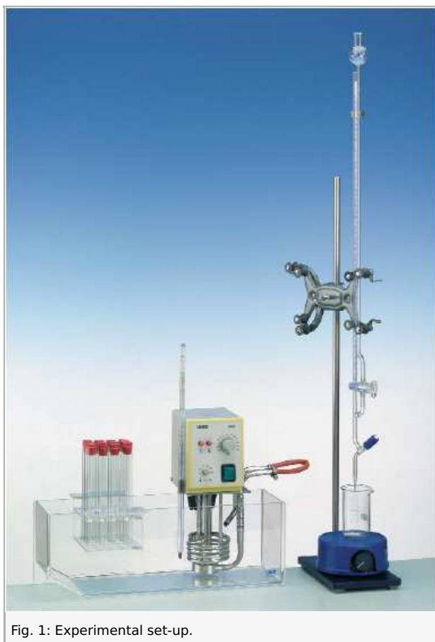
Fig. 1: Experimental set-up.