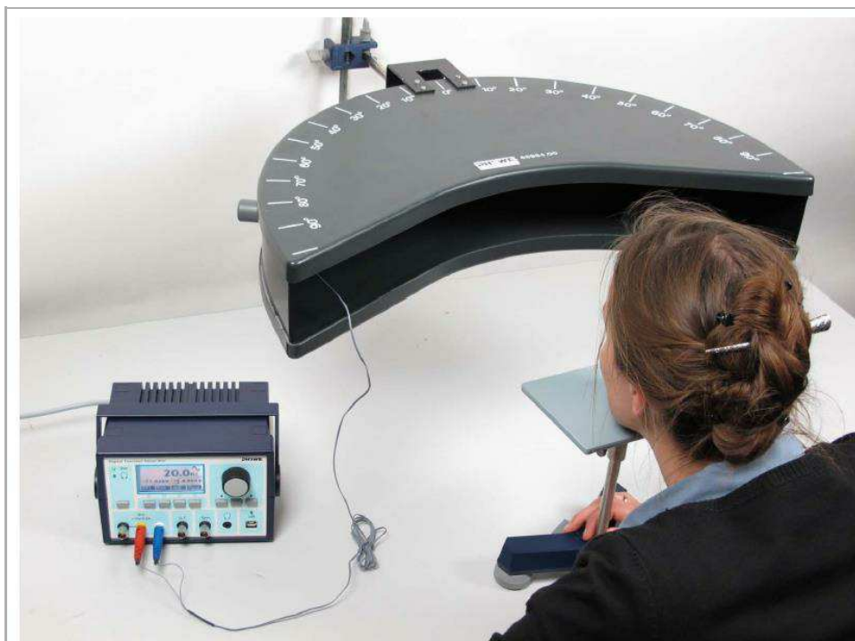
Fig.1: Experimental set-up with digital function generator