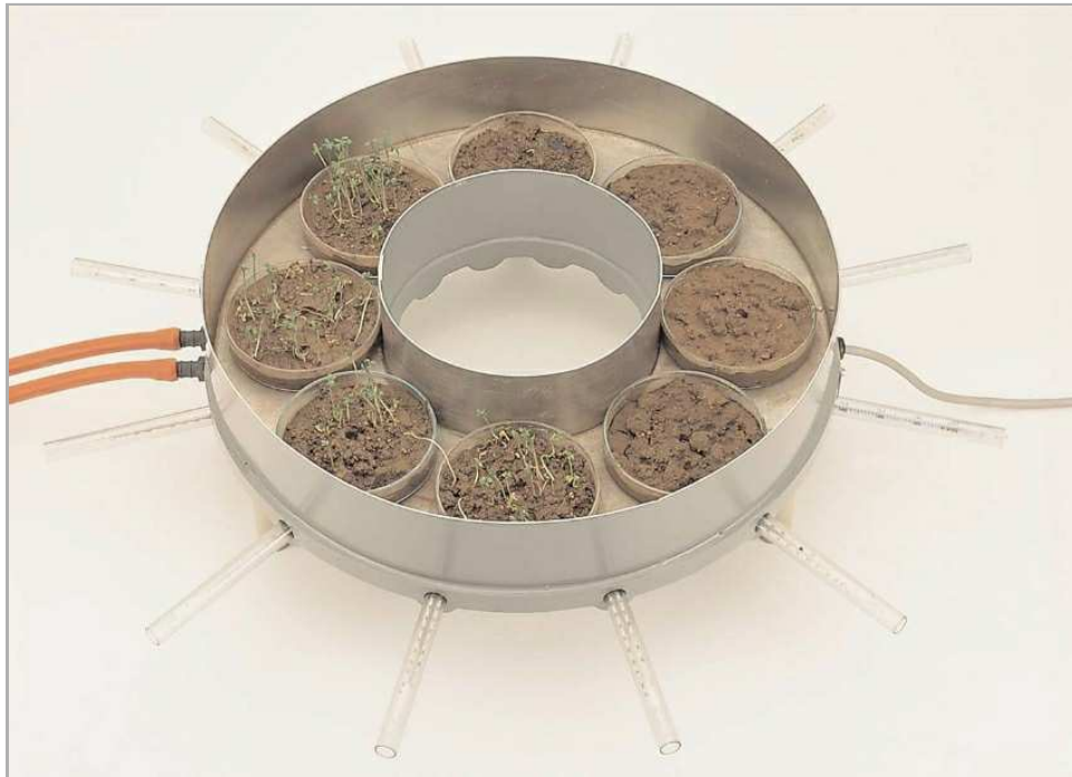
Fig. 1: Experimental set-up