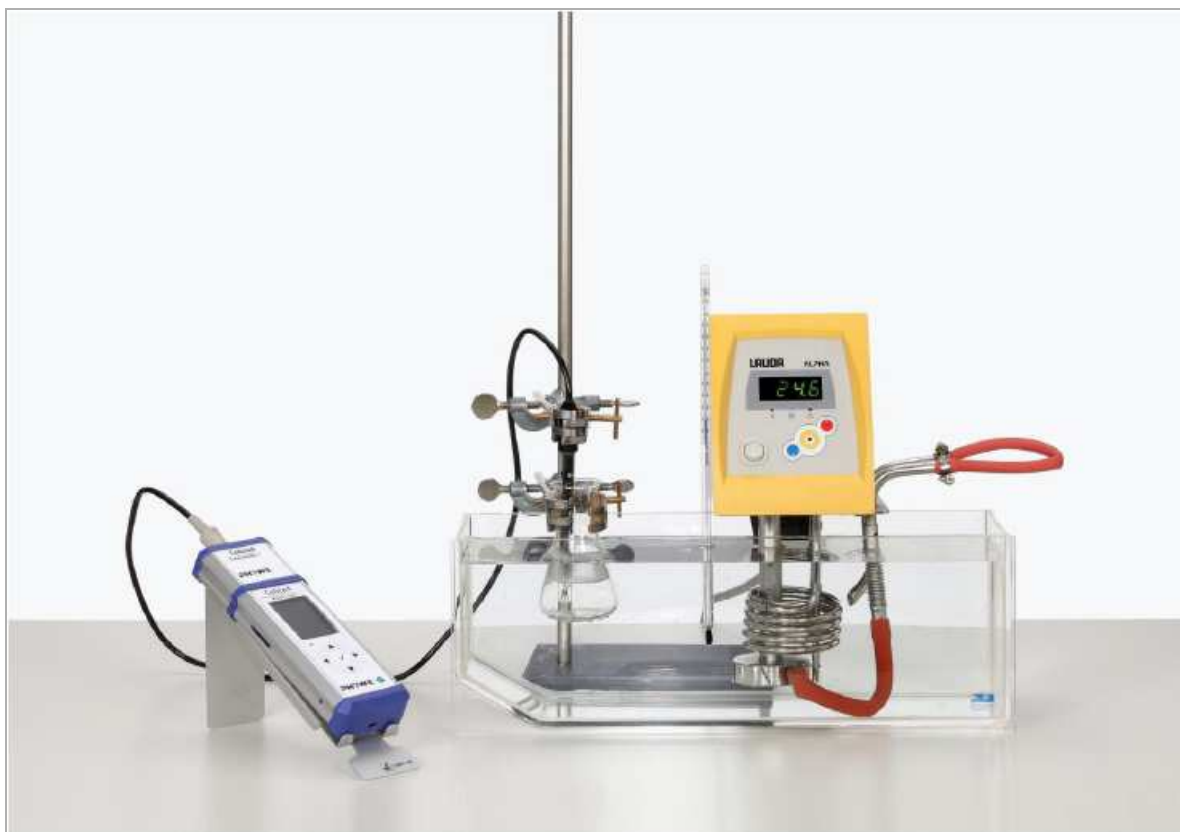
Fig. 1: Experimental setup.