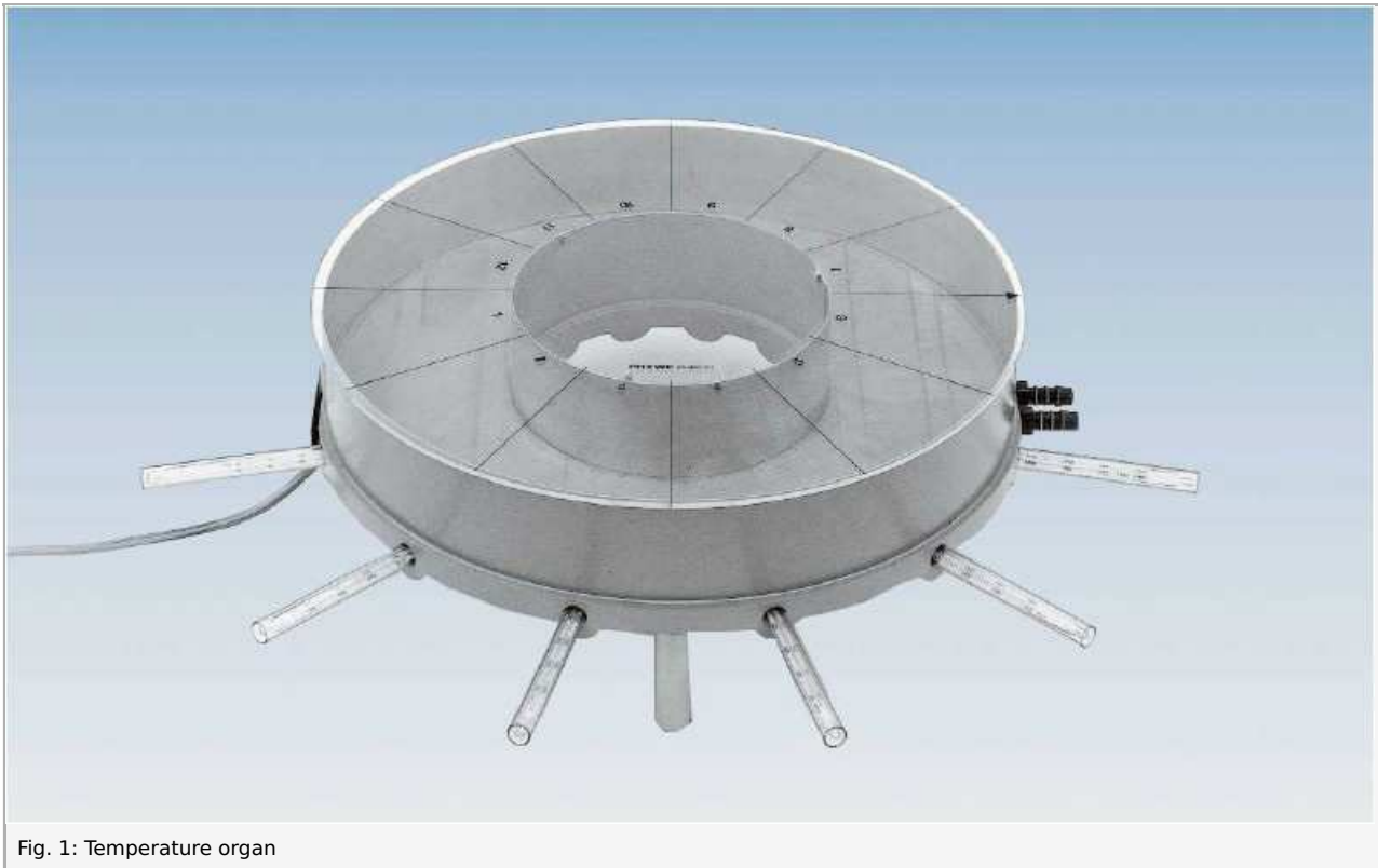
Fig. 1: Temperature organ